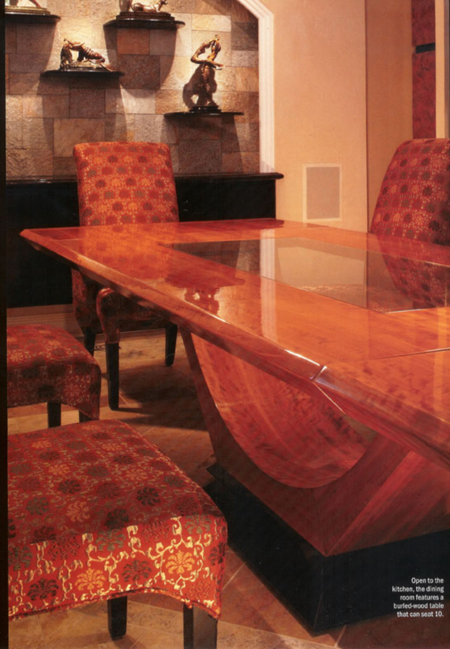
Open to the kitchen, the dining room features a burled-wood table that can seat 10.